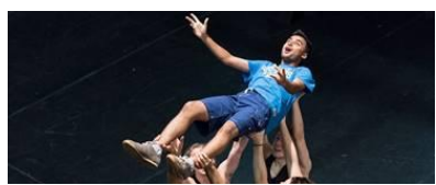
Physical Theatre - Practical Performance/Written Evaluation

Key Words / Skills: Physical Skills, Body Language, Facial Expression, Gesture, Space, Levels, Eye Contact, Stillness, Vocal Skills, Volume, Pitch, Pace, Silence, Tone, Accent, Pause, Set, Props, Sound, Lighting, Proscenium Arch, Traverse, In the Round, Thrust