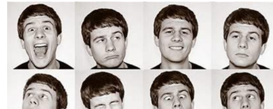
Characterisation - Practical and Written Evaluation