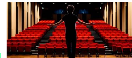
Live Theatre - Written Analysis and Evaluation