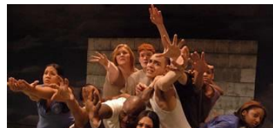
Devised Theatre - Practical Performance/Written Evaluation