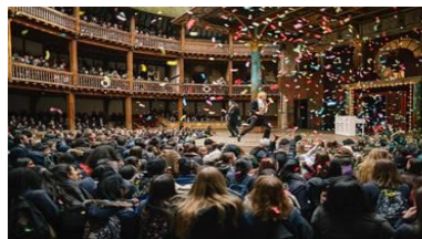
War Horse - Scripted Performance/Written Evaluation