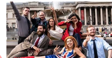
Physical Theatre - Practical Performance/Written Evaluation