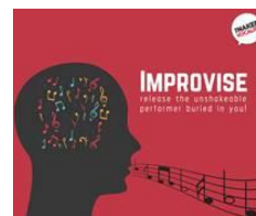
Improvisation - Devised Performance/Written Evaluation