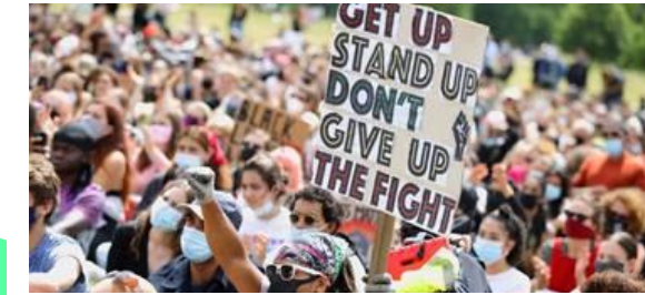
Devised - Protest Collaboration with Music and Art - Practical Performance/Written Evaluation