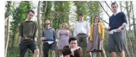
Component 3 = Blue Remembered Hills